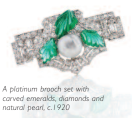
A platinum brooch set with carved emeralds, diamonds and natural pearl, c.1920